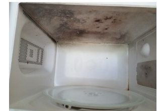
Microwave fire due to improper use

If a fire starts on stove cover with a lid and activate fire alarm. If inside a microwave do not open. Unplug microwave, and activate fire alarm.