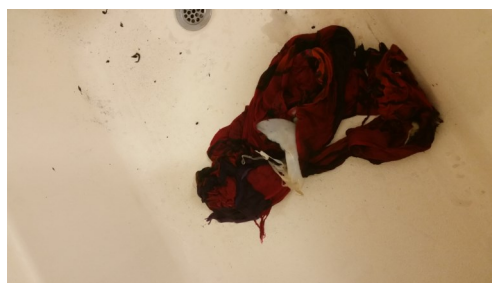
Fire in residence hall. A scarf was placed over a lamp shade creating enough heat to melt shade and catch scarf on fire.

For further information please contact Campus Safety at 540-887-7000, or visit https://marybaldwin.edu/meet-mbu/offices/campus-safety/